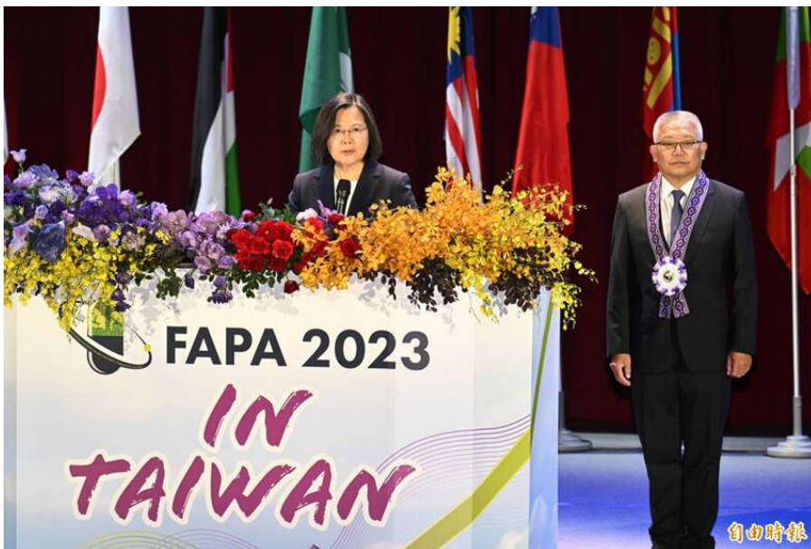
President Tsai Ing-wen welcomed pharmacists from various countries around the world to Taiwan