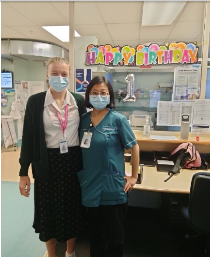
Te Whatu Ora Taranaki, emergency medicine pharmacy service, one year anniversary, Sep 2023