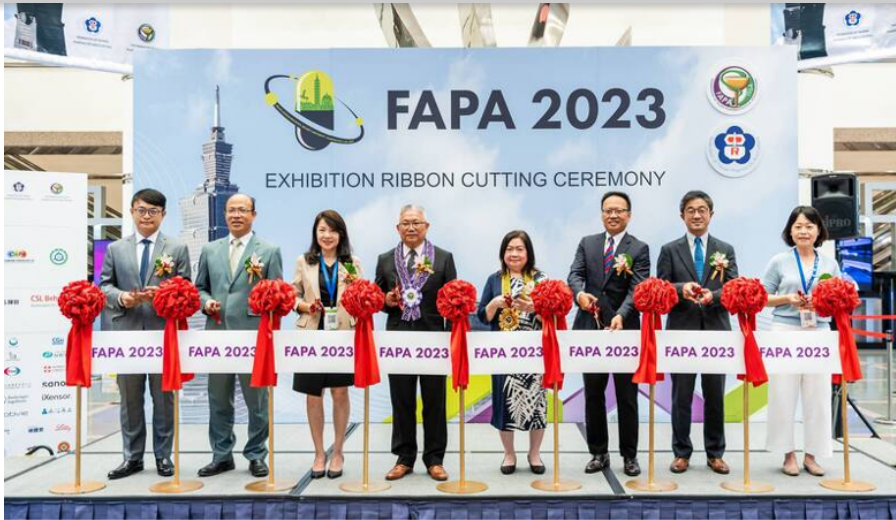
The Exhibition Ribbon Cutting Ceremony of 2023 FAPA Conference