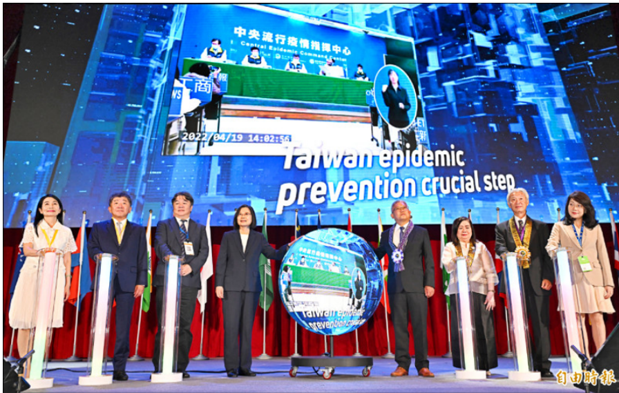
The Opening Ceremony of 2023 FAPA Conference